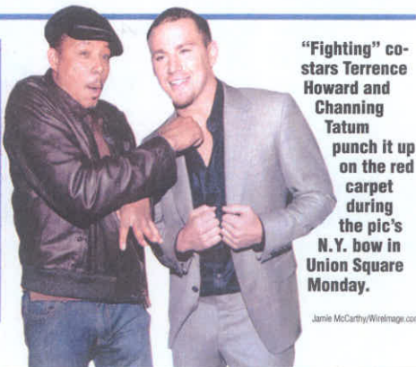
"Fighting" co-stars Terrence Howard and Channing Tatum punch it up on the red carpet during the pic's N.Y. bow in Union Square Monday.