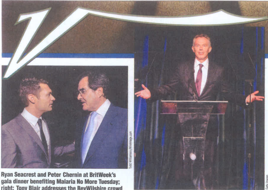
Ryan Seacrest and Peter Chernin at BritWeek's gala dinner benefiting Malaria No More Tuesday; right: Tony Blair addresses the BevWilshire crowd