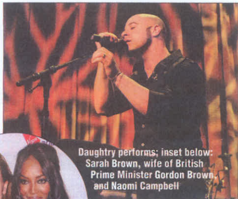
Daughtry performs; inset below: Sarah Brown, wife of British Prime Minister Gordon Brown and Naomi Campbell

$500,000, and Ryan Seacrest, who has hosted "American Idol" specials focusing on malaria, appeared onstage and pledged $100,000.