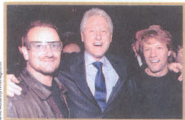
Bono, Bill Clinton and Jon Bon Jovi join forces for Food Bank for New York City's sixth annual Can-Do Awards dinner Tuesday.

Seacrest's presence inspired Blair to recount his own story of trying to launch a singing career — but he admitted that when he auditioned, "It wasn't like a Susan Boyle moment." During one tryout, he got cut off by the producers. "I said, 'Why do you do that?' 'Act of humanity, mate, act of humanity.'"