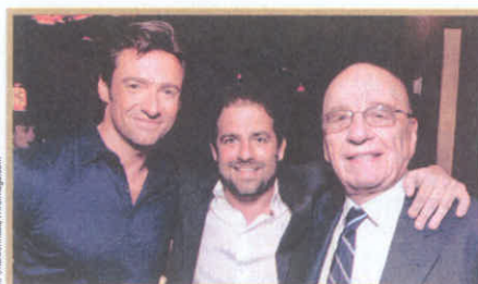
Hugh Jackman, Brett Ratner and Rupert Murdoch celebrate Jackman's hand and footprint ceremony at Grauman's Theater in Hollywood Tuesday.